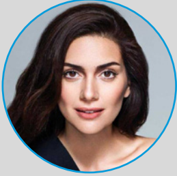
BERGÜZAR KOREL 1001 Nights, Karadayı, Wounded Love