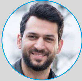
MURAT YILDIRIM Love & Punishment Game of Silence