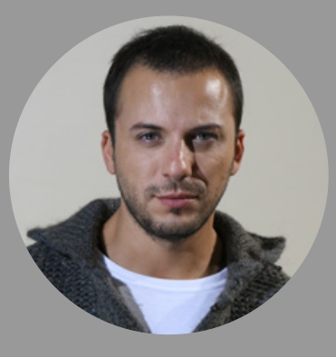
Serkan Altunorak Magnificent Century