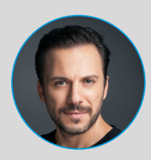
SERKAN ALTUNORAK Magnificent Century Brave & Beautiful